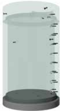
(mass - 1786 kg)