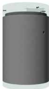
(mass - 2007 kg/m)